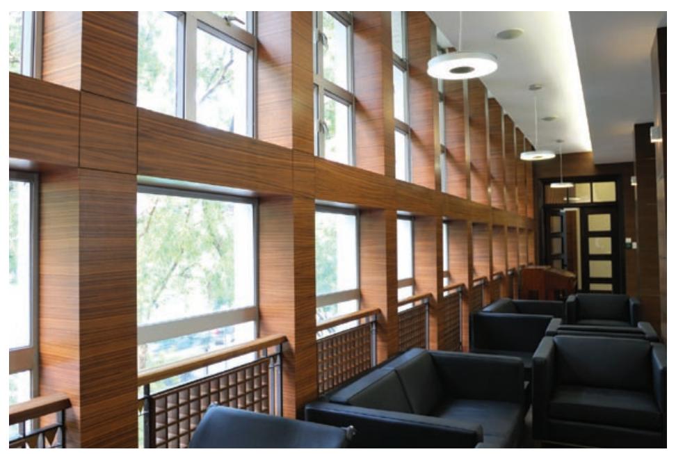
The Second Floor of Wong Ming Him Hall is renovated to be both a meeting area and an archive show room.