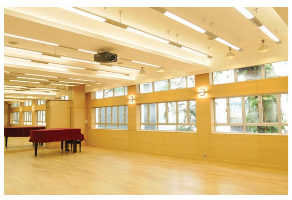
Yes, you have guessed it right! We can enjoy dancing and drama on the whole first floor, the Rehearsal Room.