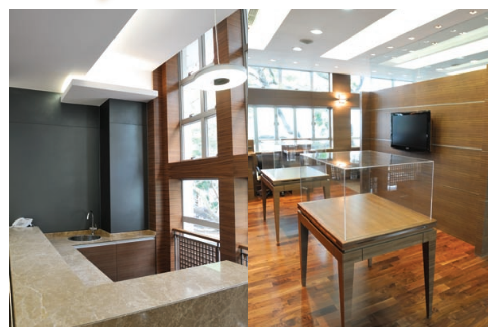
A pantry is located at the corner of the Second Floor.